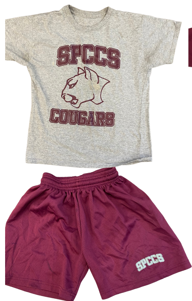
All PE Days